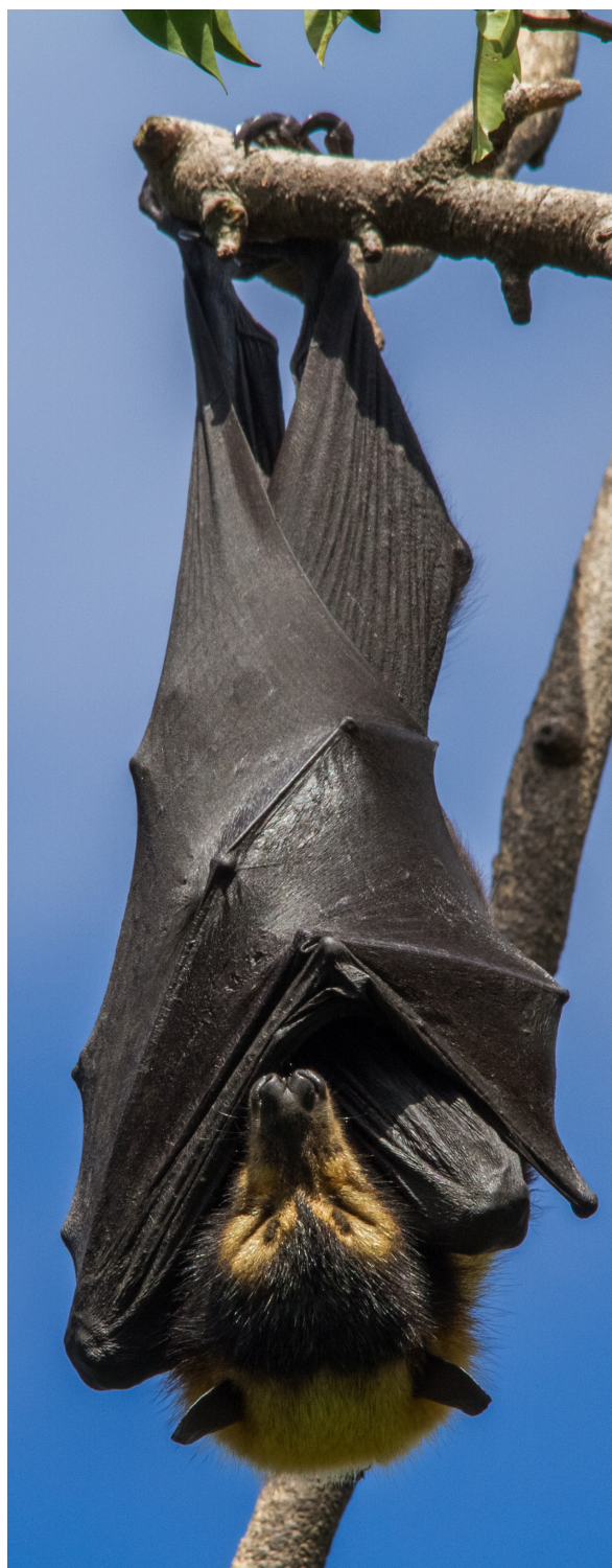
Fruit bats sleep while hanging upside down from branches.

What about the hanging bat? Some people might imagine that, because bats can fly, they must not be affected by gravity. However, that's not true: the force of gravity acts on any object within Earth's gravitational field, even if that object is not touching Earth. As a bat flies, Earth is still pulling it downward, so the bat has to flap its wings to stay in the air. Even astronauts in space are within Earth's gravitational field, so they are affected by Earth's gravitational pull. However, Earth's gravitational field gets weaker with distance. The closer an object is to Earth, the stronger the force of gravity on that object.